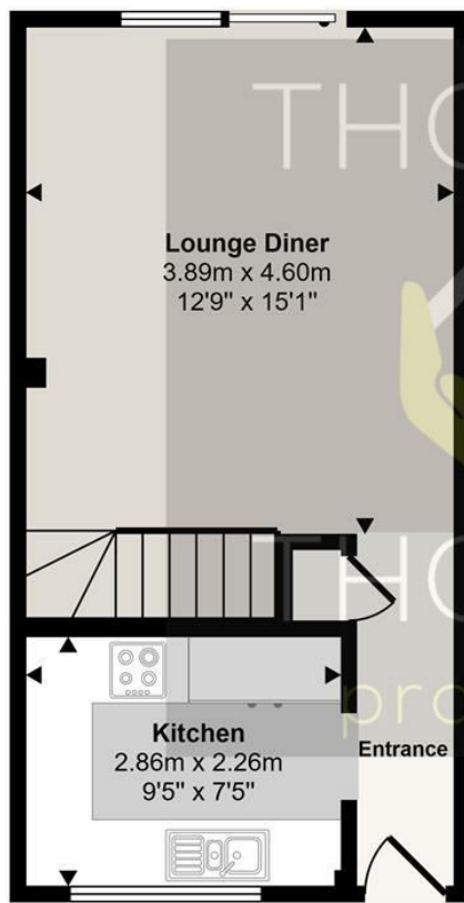
Ground Floor Approx 31 sq m / 329 sq ft

Approx Gross Internal Area 61 sq m / 654 sq ft