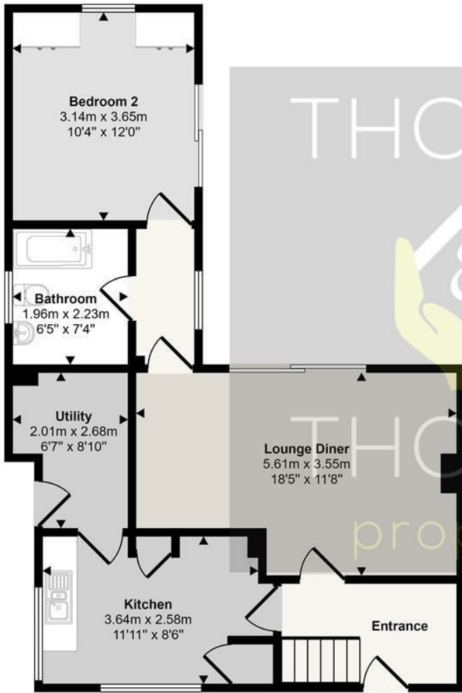
Ground Floor Approx 60 sq m / 641 sq ft

Approx Gross Internal Area 101 sq m / 1088 sq ft