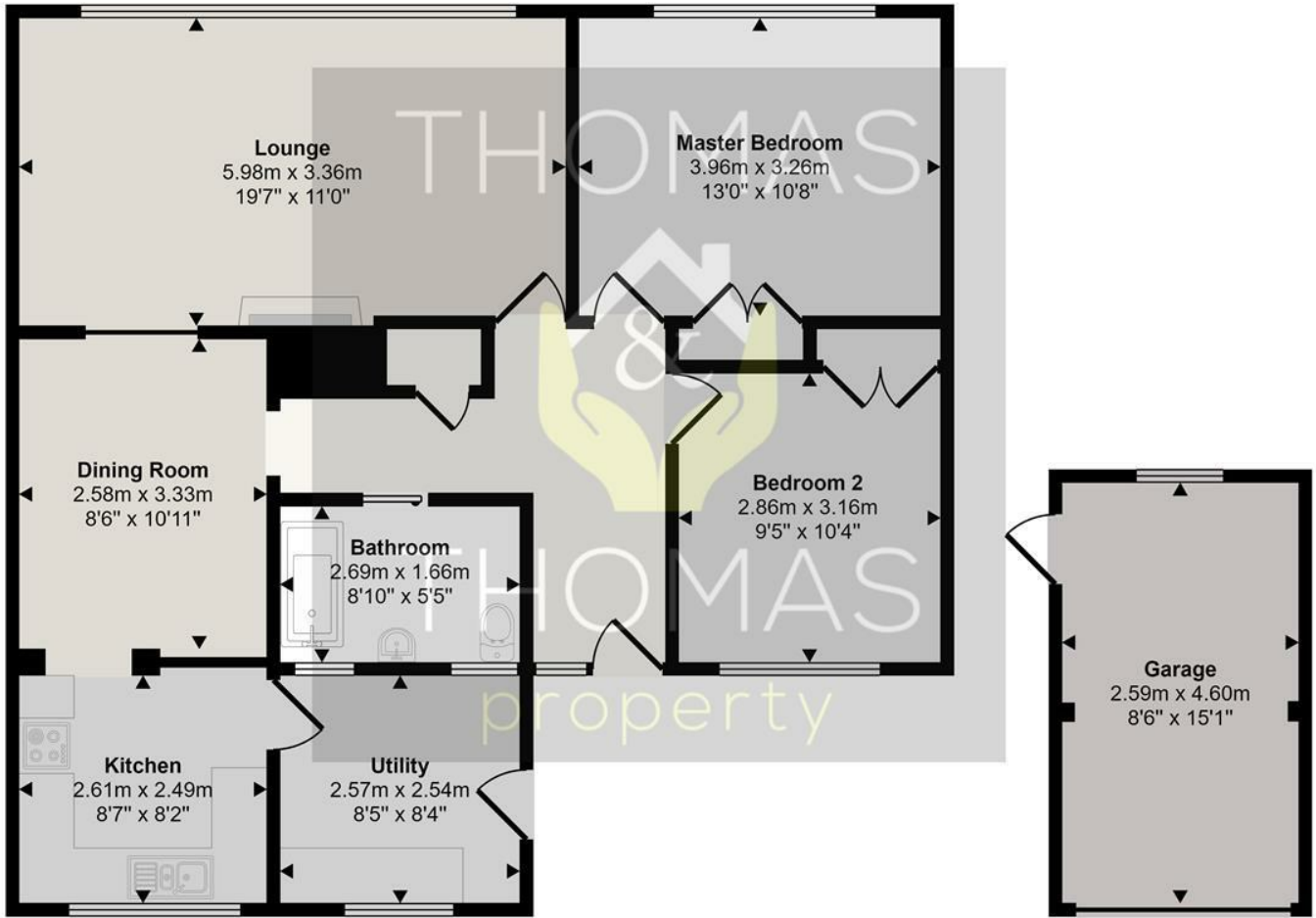
Floorplan Approx 85 sq m / 910 sq ft

Approx Gross Internal Area 96 sq m / 1038 sq ft