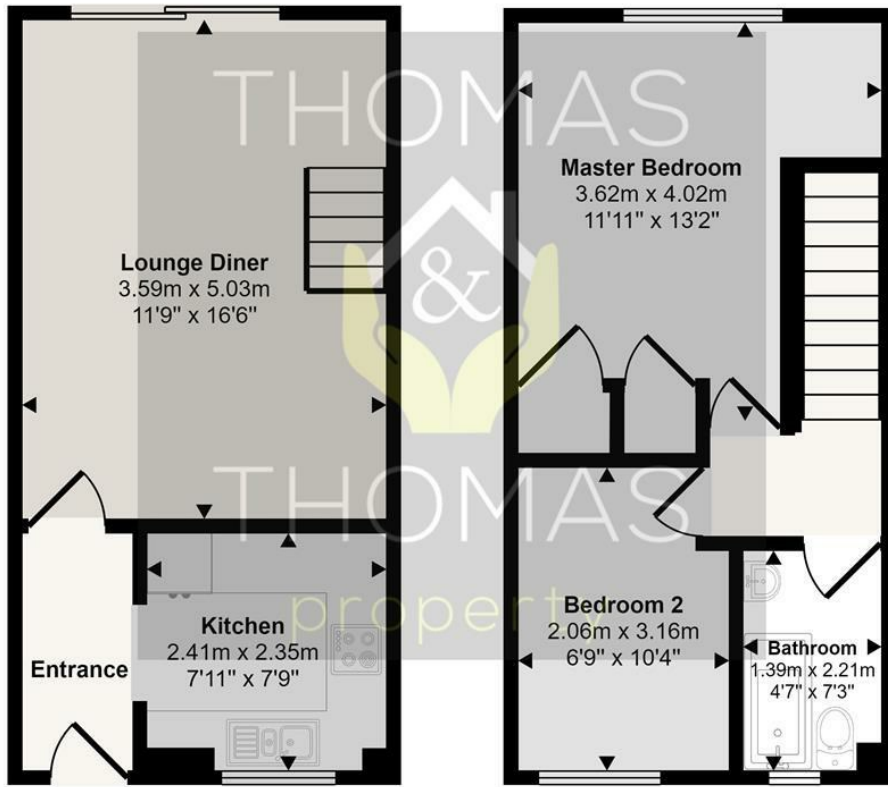
Ground Floor Approx 27 sq m / 295 sq ft

Approx Gross Internal Area 55 sq m / 593 sq ft