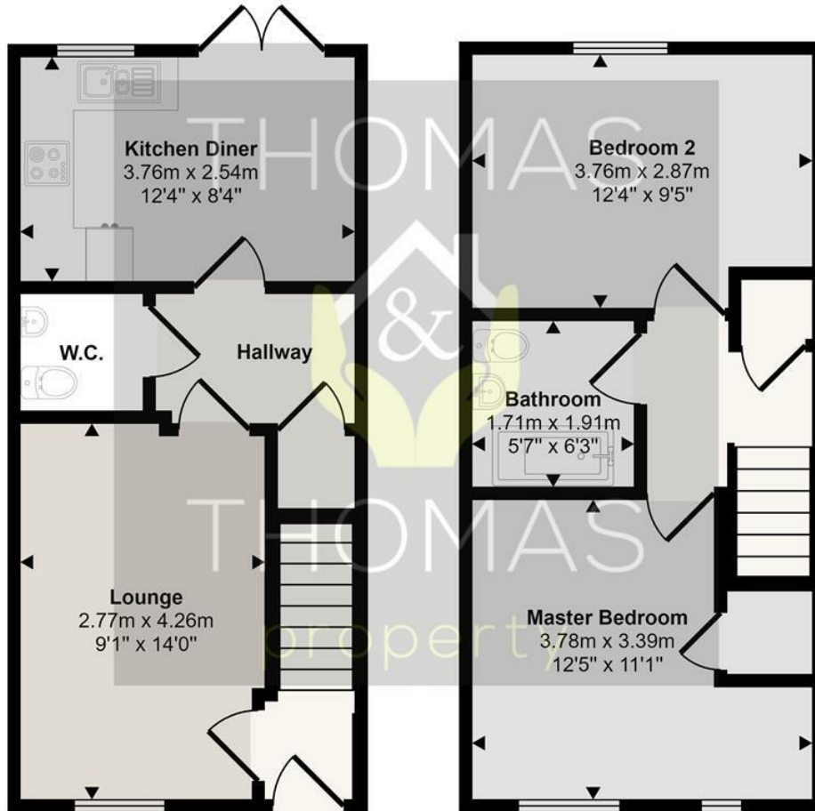
Ground Floor Approx 32 sq m / 342 sq ft

Approx Gross Internal Area 64 sq m / 685 sq ft