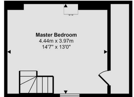
Second Floor Approx 21 sq m / 231 sq ft

This floorplan is only for illustrative purposes and is not to scale. Measurements of rooms, doors, windows, and any items are approximate and no responsibility is taken for any error, omission or mis-statement. Icons of items such as bathroom suites are representations only and may not look like the real items. Made with Made Snappy 360.